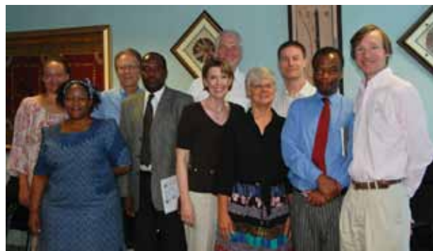
Meeting with the Ministry of Health, Botswana

“What we are hoping comes from Shoshong is a universal model of care for spinal disorders that is applicable to future WSC locations and beyond”